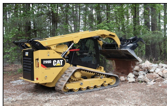
Wingfield Training Location: 11 Rosberg Road, Wingfield