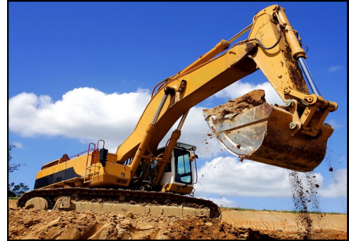
Wingfield Training Location: 11 Rosberg Road, Wingfield