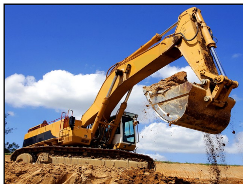
Wingfield Training Location: 11 Rosberg Road, Wingfield