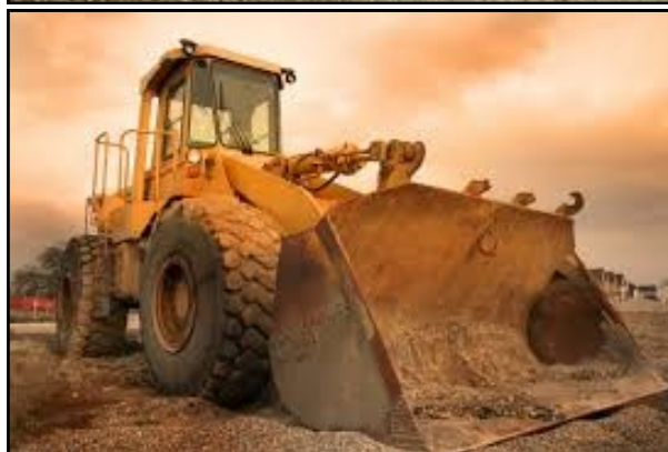
Wingfield Training Location: 11 Rosberg Road, Wingfield