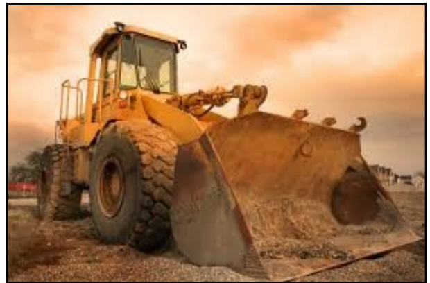
Wingfield Training Location: 11 Rosberg Road, Wingfield