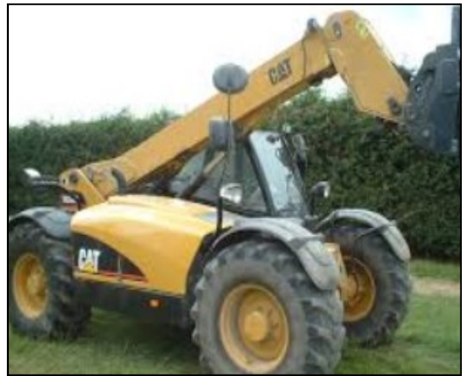
Wingfield Training Location: 11 Rosberg Road, Wingfield