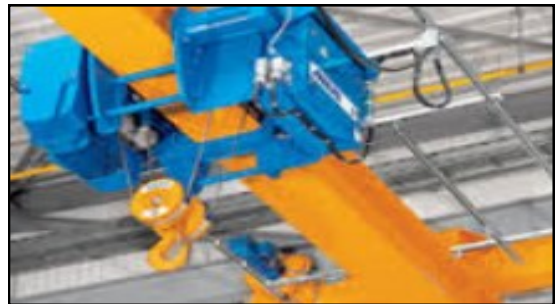
Dudley Park Office Location: 7 La Salle Street, Dudley Park