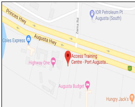
Port Augusta Office Location: 20257 Augusta Highway, Port Augusta