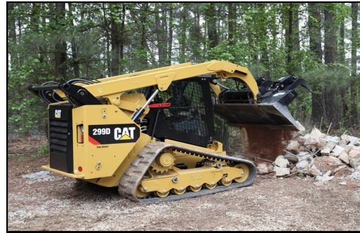
Wingfield Training Location: 11 Rosberg Road, Wingfield