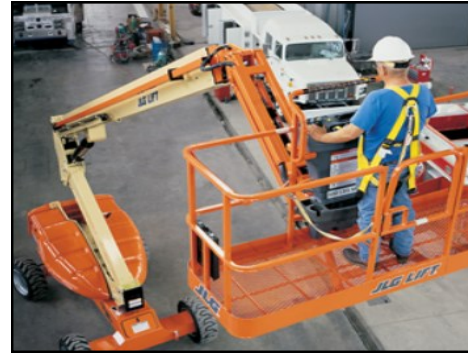
Wingfield Training Location: 11 Rosberg Road, Wingfield