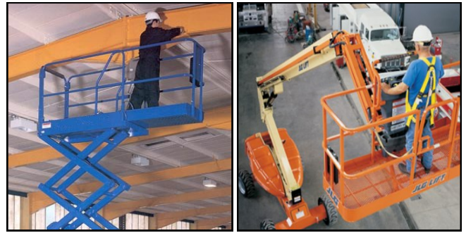
Wingfield Training Location: 11 Rosberg Road, Wingfield