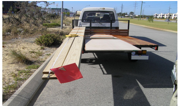
Wingfield Training Location: 11 Rosberg Road, Wingfield